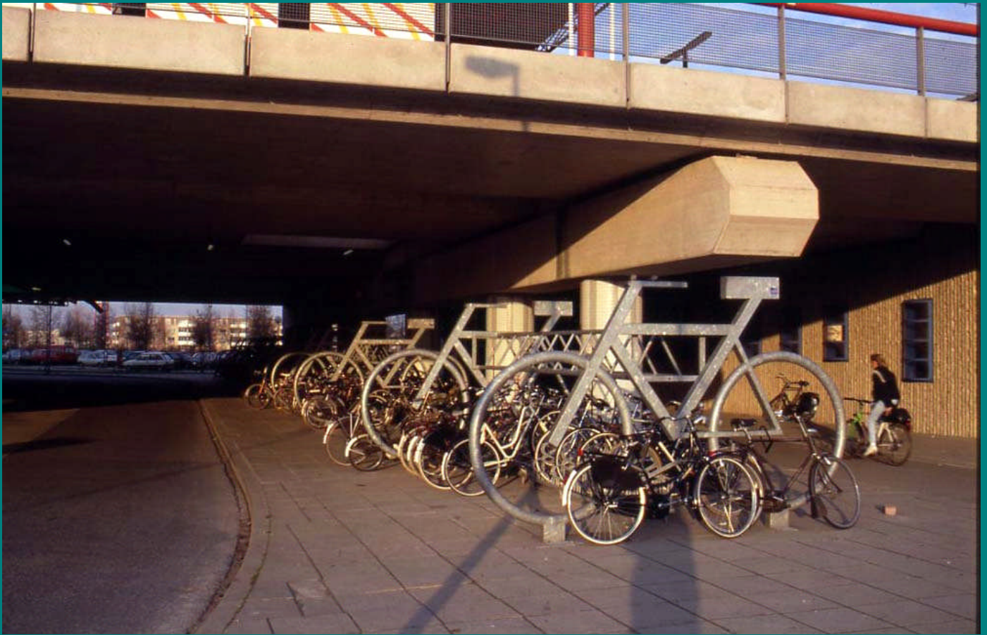
Cycle parking at a rail station in Holland.