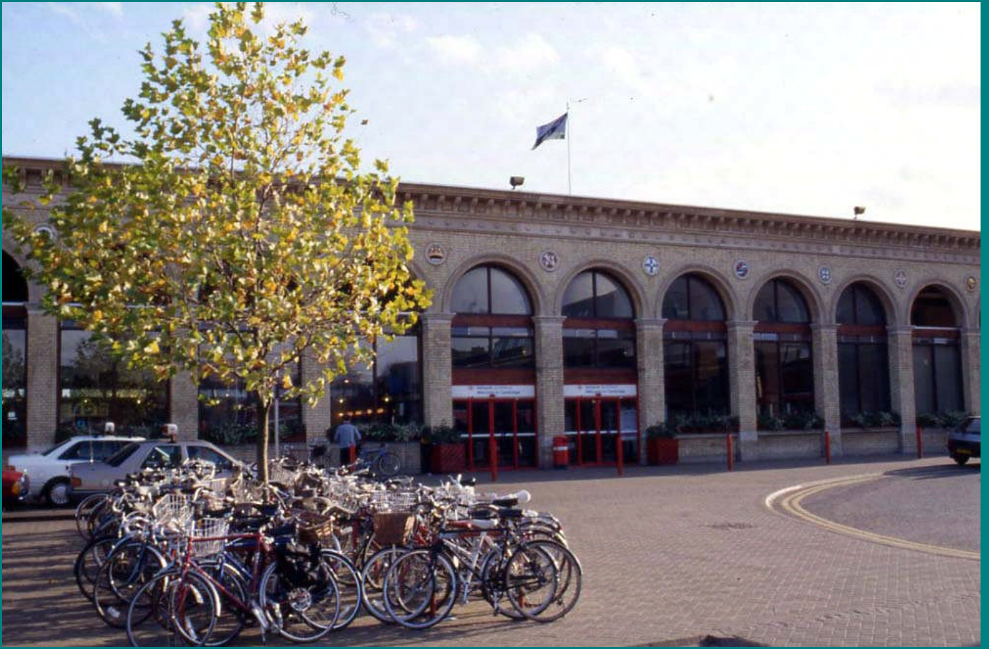
Cycle parking at Cambridge station.