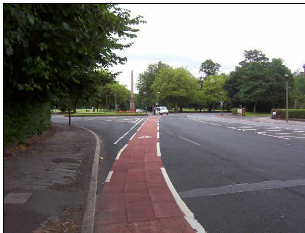
Coloured cycle lane crossing side road junction and set out from give way line to discourage encroachment

An advisory lane passing the mouth of a side road is useful in alerting motorists to the likely presence of cyclists but they are sometimes blocked by emerging vehicles about to join the main road. The problems this creates for cyclists can be reduced by using a coloured surface in the lane to emphasise its existence, and by making it wide enough to accommodate cyclists forced to weave around vehicles partially blocking it.