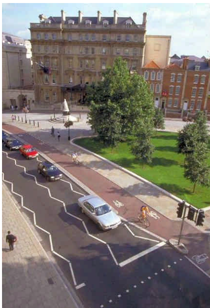
Two-way cycle lane, Bristol