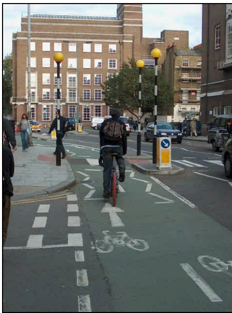
Two-way cycle lane, Camden