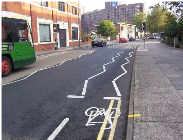
Cycle lane at a Zebra crossing, Ipswich. Note that the cycle logo overlaps the double yellow lines – see text

The cycle logo to Diag 1057 should not overlap the lane markings or other markings such as double yellow lines. Where this does occur it may be an indication that the lane is too narrow.