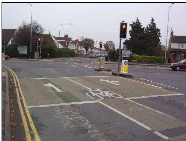
ASL at signals with filter, Swindon

Where there are filter lights for left or right turning traffic, cyclists should be able to safely reach the reservoir when the filter signal is green. Waiting cyclists should not be put in a position where they obstruct traffic moving off on the green filter. One innovative solution has been to create a split cycle reservoir with additional markings to indicate on which side cyclists should wait (see picture below). Adopting such a solution requires special authorisation.