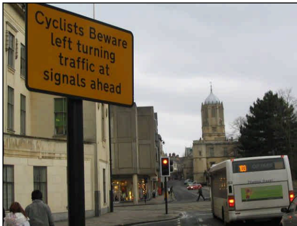
Sign warning cyclists of left turning vehicles, Oxford

Care should also be taken at signals where there are large numbers of HGVs turning left because of the potential for cyclists to move into the driver's blind spot. In some cases warning signs have been posted for both cyclists and lorry drivers. Another potential hazard is where car occupants open the nearside door into the path of a cyclist. Typical locations may be where car drivers drop off passengers, e.g. at rail or coach stations. If there is a high incidence of this, a non-nearside lead-in lane might be the solution.