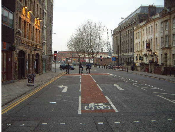
Central lead in lane, Bristol

Designing non-nearside lead-in lanes requires more care because of the way in which they operate. The main benefit of nearside lead-in lanes for cyclists is that they make it easier for them to get ahead of rows of stationary vehicles waiting at signals. Non-nearside lead-in lanes also fulfil this purpose, but more importantly they serve as a means of protecting cyclists in potentially vulnerable situations.