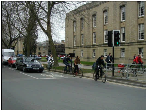
Typical ASL installation, Oxford

ASLs should extend across all the traffic lanes. Part-width ASLs do exist but they need to be individually authorised as they are not covered by TSRGD. It should be noted that ASLs can only be used at signalised junctions. TSRGD specifically does not authorise their use at signalised cycle and pedestrian crossings i.e. Pelicans, Puffins and Toucans.