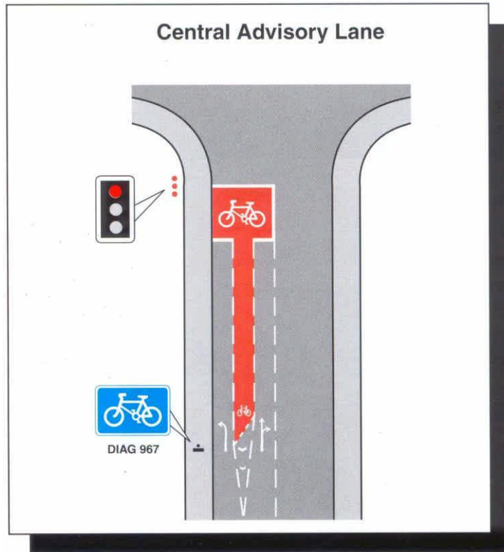
From Traffic Advisory Leaflet TAL 8/93

In determining the best solution the designer needs to consider how difficult it is for cyclists to position themselves correctly at the reservoir (partly dependent on the width and depth of the ASL) against how difficult it is for cyclists to move from the nearside into a central or off-side cycle lane. In cases where there is localised widening or flaring on the approach to the junction from one lane to two lanes, the best option is sometimes for the advisory lane to move from the nearside to the middle of the two vehicle lanes at the point of widening, so that motorists moving into the left lane have to cross the cycle lane. The cycle lane should have a coloured surface to make it conspicuous (see picture below).